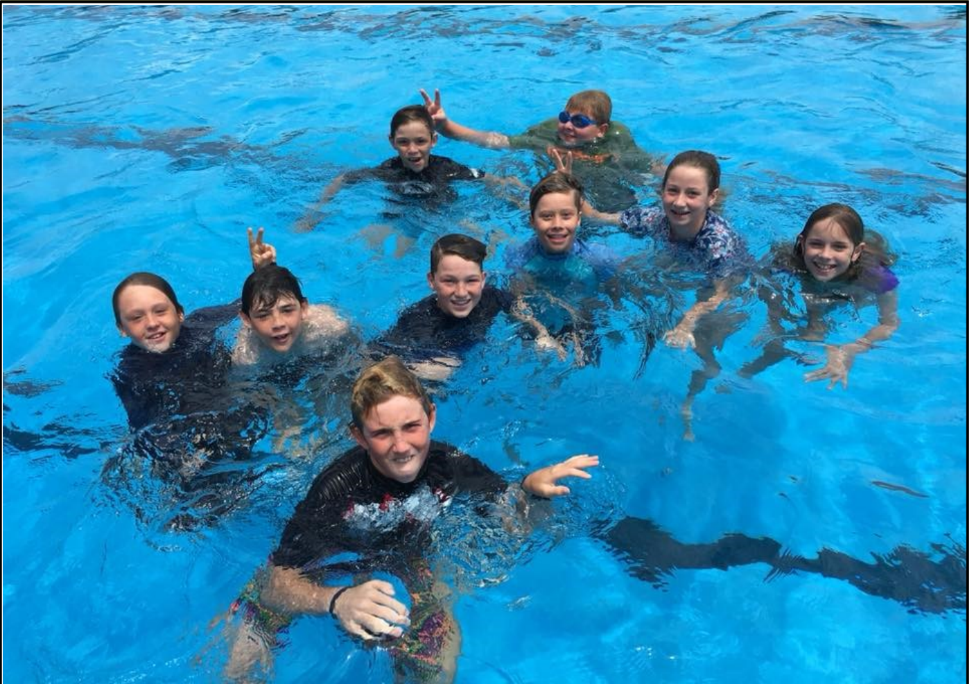
Cooling off after the Film Festival.