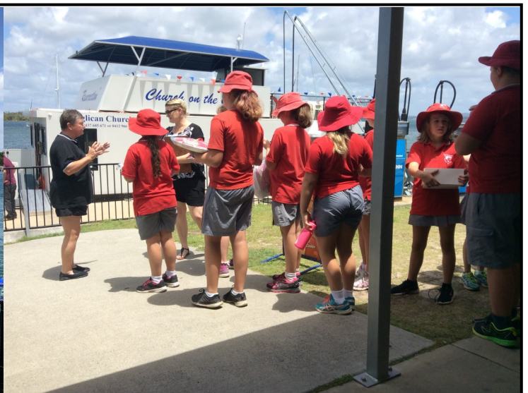
Cruising the Clarence