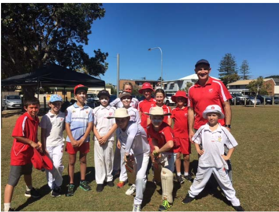
Well done to our PSSA Cricket Team who travelled to Lennox Head to compete in Round 5 last week.