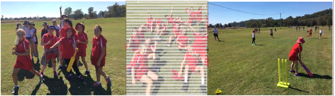
Some of our students at Milo Cricket last Wednesday